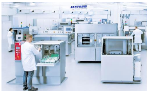
Machine Test Center